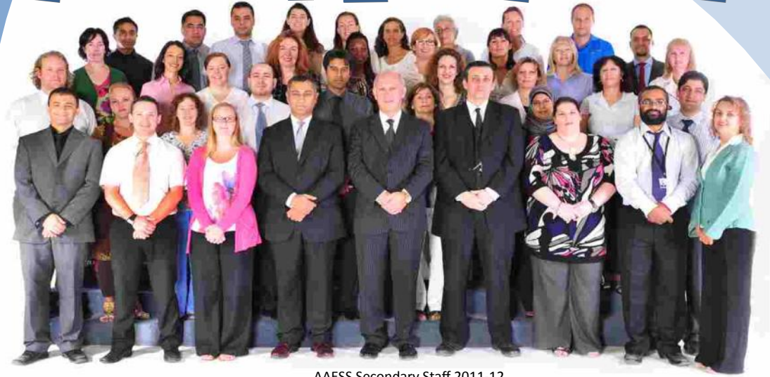
AAESS Secondary Staff 2011-12

Dear Parents, Students, and friends of AAESS welcome to the new Academic year